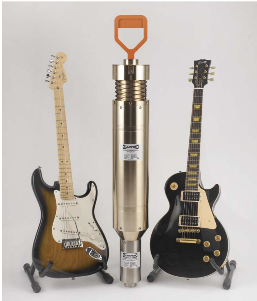
Peak performers always select the very best instruments.

ClampOn programmable automation controllers (PAC) combine the small form factor, reliability and ruggedness of a controller with the flexible and user-friendly client interface known from our software for other platforms. A single controller can handle up to 250 ultrasonic sensors and is simple to control remotely via a network (Network interface with embedded FTP, WEB, Modbus and ClampOn servers). The controller can easily be expanded with hot-swappable IO modules (4-20 mA, relay, CANbus, Profibus etc.); it runs on 24 VDC (6W) and can be mounted on a DIN-rail. The