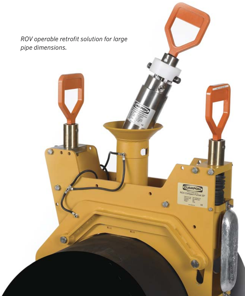
ROV operable retrofit solution for large pipe dimensions.

Since 1995, ClampOn has supplied thousands of «Ultrasonic Intelligent Sensors» to oil and gas companies all over the world, which have benefited from the use of our systems and found them extremely satisfactory. Our systems are preferred to the alternatives because of their repeatability, accuracy and robustness, and our company's expertise in this field. Continuous technology development and personnel training have made ClampOn the winner of all field and laboratory tests in which we have participated, a position we are determined to maintain in the future.