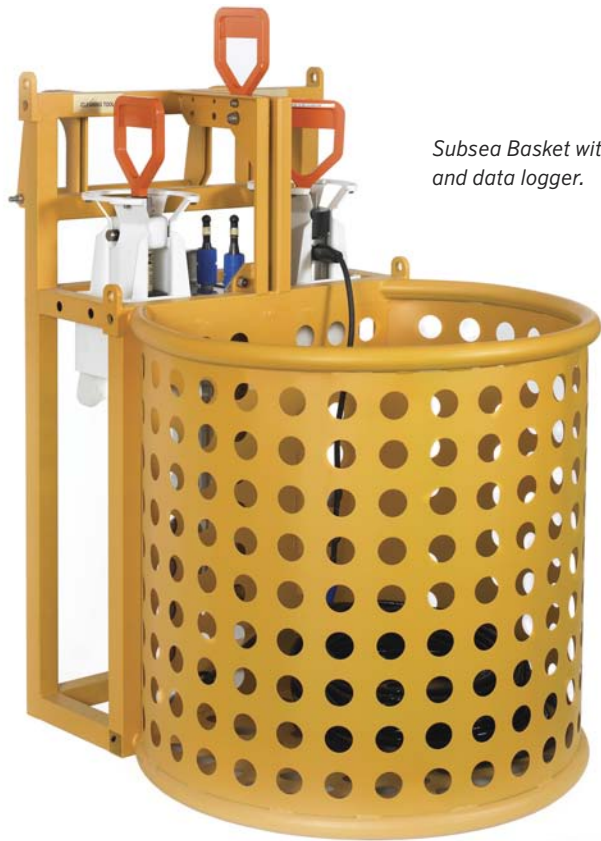
Subsea Basket with battery and data logger.